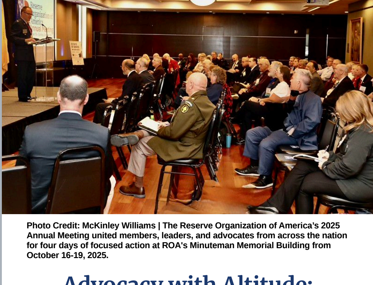
The Reserve Organization of America's 2025 Annual Meeting united members, leaders, and advocates from across the nation for four days of focused action at ROA's Minuteman Memorial Building from October 16-19, 2025.